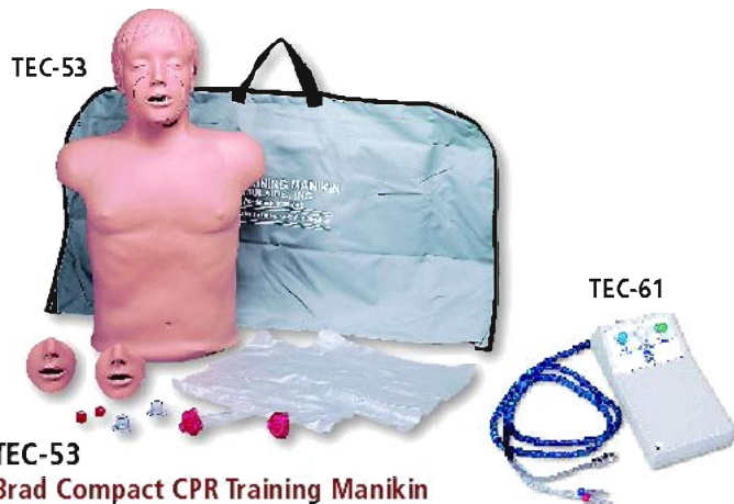
TEC-53 Brad Compact CPR Training Manikin

This economical CPR manikin is constructed of soft, realistic vinyl plastic over polyurethane foam for a "human" feel. Features include: a longer torso for realistic abdominal thrusts, realistic head tilt and chin lift for opening airway, can easily be manipulated to realistically simulate airway obstruction or choking situations, and a user-friendly lung/airway design that eliminates cleaning. Includes three mouth/nose pieces and three disposable lung/airway systems. Nylon carry bag and kneeling pads included. Dimensions: 71 x 46 x 25 cm. Sh. wt. 7.74 kgs.