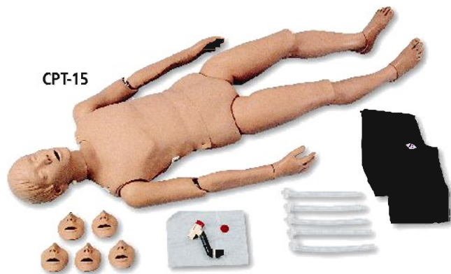
CPT-15 Full Body CPR Manikin

A rugged rescue/CPR manikin that replicates a wide range of real-life trauma conditions a rescuer may encounter. As a rescue manikin, it simulates the resiliency of a human body for realistic practice in transport rescue and lifesaving medical procedures. As a CPR manikin, it is used to demonstrate proper CPR technique. It offers lifelike anatomical landmarks (sternum, ribcage, and sternal notch) and natural resistance to chest compression. Its patented airway is designed to inflate the lungs only if the head is extended and accurately positioned. Each manikin comes with a total of five airways with lungs and non-rebreathing valves, five face pieces, and four airway plugs. Dimensions: 127 x 55 x 54 cm. Sh. wt. 27.21 kgs.