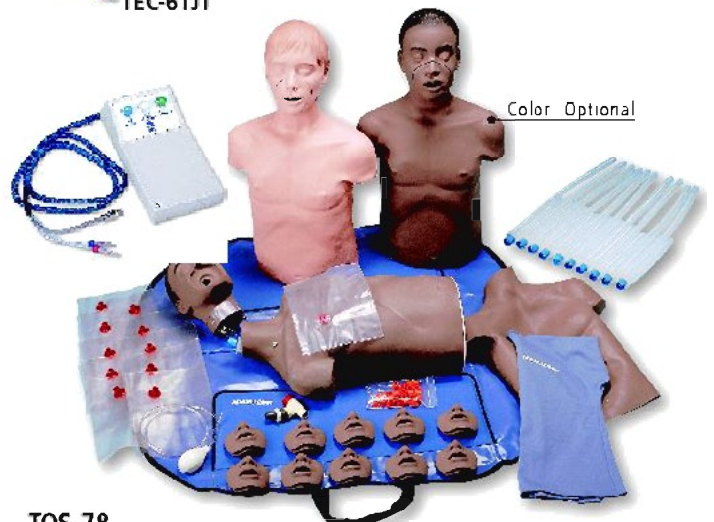
TOS-78 Adam CPR Training Manikin

Dimensions: 71 x 46 x 25 cm. Sh. wt.: 8,5 Kg.